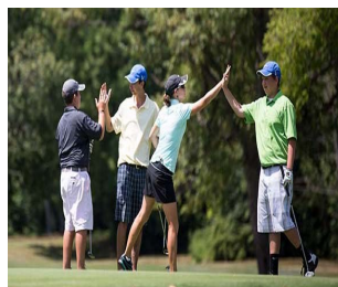
Junior Play Days